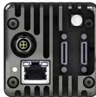
With Camera Link® Output