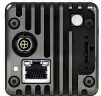
With USB 3 Output